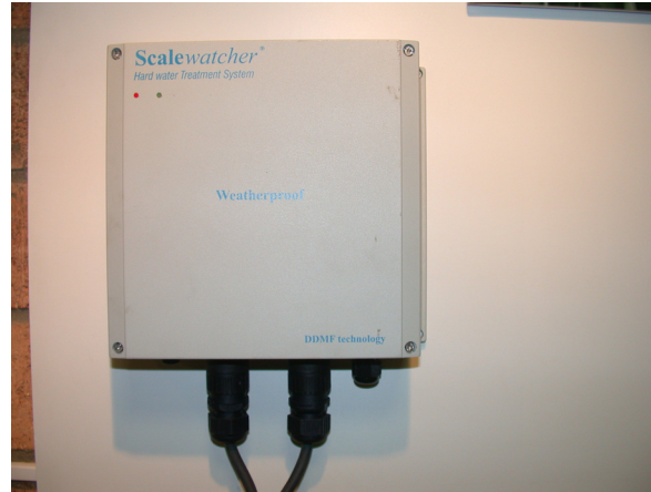
Enclosure type: CMN