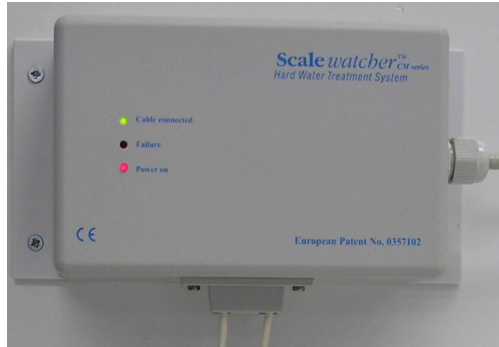
Enclosure type: CM