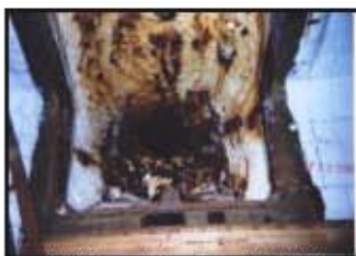
2 Rust problem. May 12, 1994