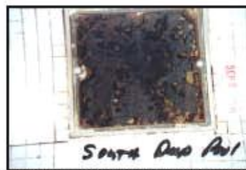
7 Barnacles shrunk and became black, September 9, 1995