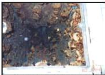
6 Less barnacles, October 6, 1994

Scalewatcher also decreases the other problem, barnacles of iron bacteria. Pictures 3, 6 and 7 show how Scalewatcher™ is removing the barnacles at the outlet in the pool's deep end. These pictures have been taken from the Southern Deep Pool on respectively May 12, 1994, October 6, 1994 and September 9, 1995. The pictures show also a change in color of the barnacles from brown to black. This is a good sign according to Robert Finley.