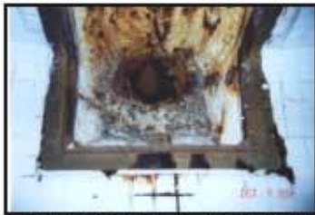
4 Rust is disappearing, October 6, 1994

After researching various products, Robert Finley decided to test the Scalewatcher™ Electronic Descaling System to remove and prevent rust. The Scalewatcher Olympic was installed on May 12, 1994 and on that day a picture was taken of the outlet of the North Shallow Pool. See picture 2. Rust at the bottom of the outlet is clearly visible. After half a year, on October 6, 1994 another picture (4) was taken of the same outlet. Progress is clearly visible. Picture five was taken on September 9, 1995 and shows that the rust has disappeared completely.