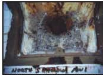
5 Rust disappeared, September 9, 1995

Scalewatcher also decreases the other problem, barnacles of iron bacteria. Pictures 3, 6 and 7 show how Scalewatcher™ is removing the barnacles at the outlet in the pool's deep end. These pictures have been taken from the Southern Deep Pool on respectively May 12, 1994, October 6, 1994 and September 9, 1995. The pictures show also a change in color of the barnacles from brown to black. This is a good sign according to Robert Finley.