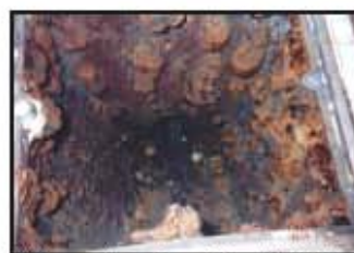
3 Barnacle problem. May 12, 1994