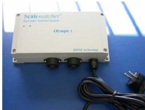
Enclosure type: ½ CMN