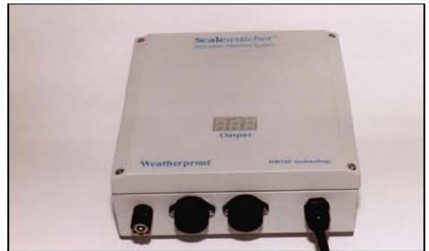
Enclosure type: IE